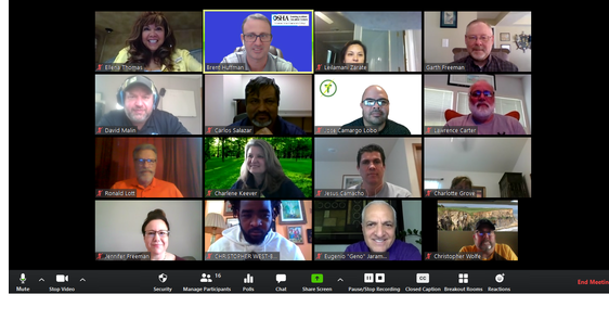
OSHA #510 Video Conference Participants

“Bongo”, which provides a seamless way to connect face-to-face.